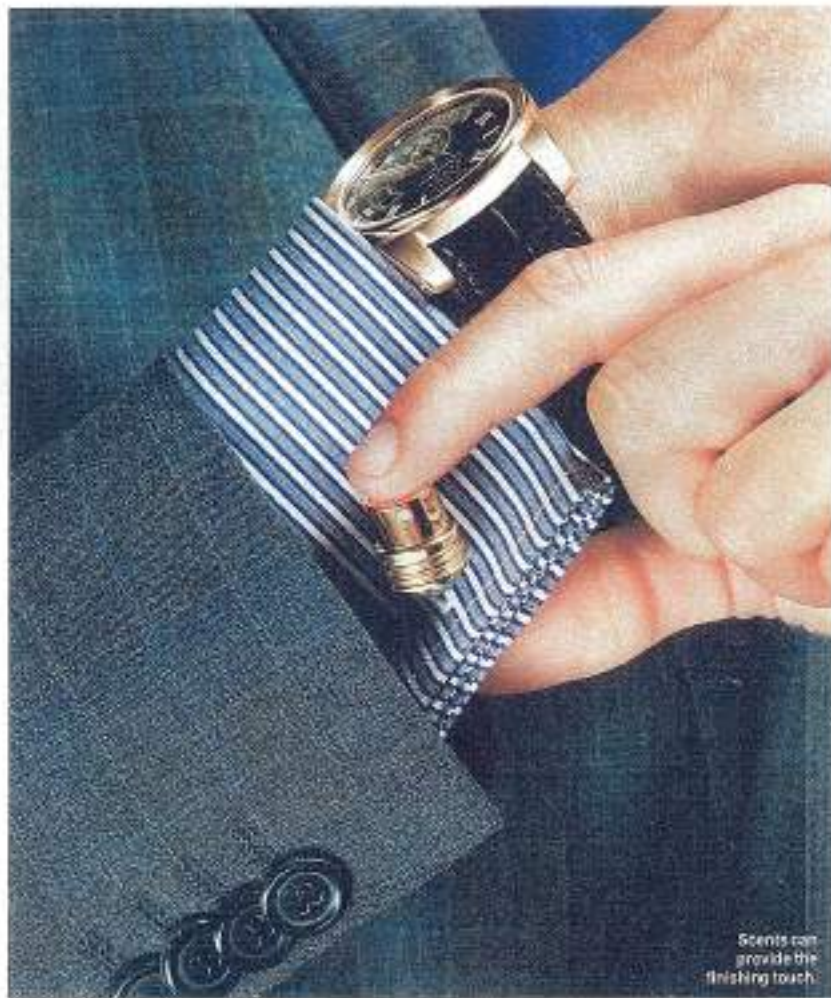
Scents can provide the finishing touch.