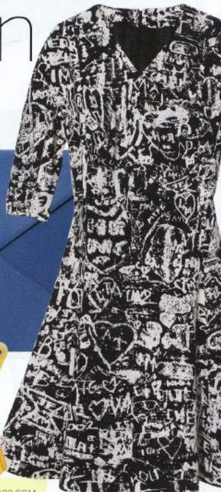
Carven dress, $870; Bergdorf Goodman, NYC.