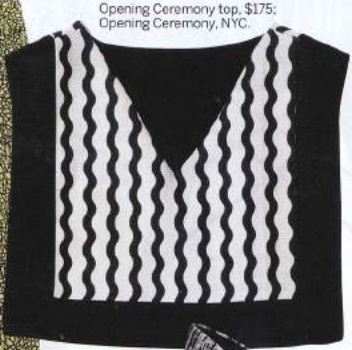
Opening Ceremony top, $175; Opening Ceremony, NYC.