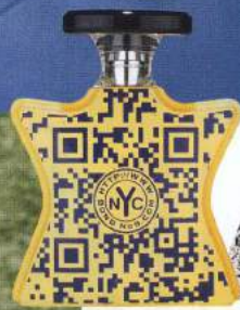
Bond No. 9 HTTP://WWW.BOND09.COM Eau de Parfum, $250; bondno9.com.