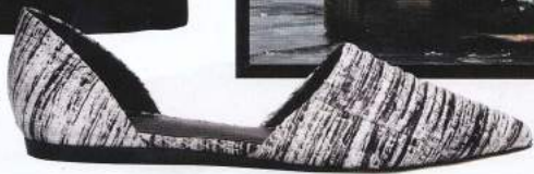
Vince flats, $325; nordstrom.com.