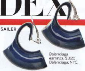
Balenciaga earrings, $365; Balenciaga, NYC.