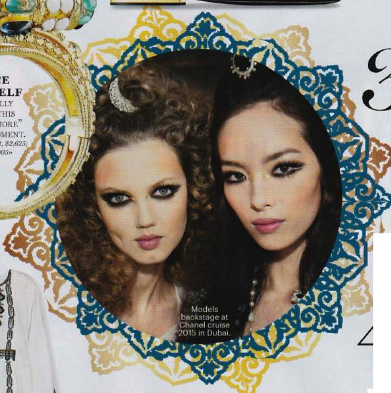
Models backstage at Chanel cruise 2015 in Dubai.

1 BRACE YOURSELF I'M TOTALLY FEELING THIS "MORE-IS-MORE" JEWELRY MOMENT. «Chanel bracelet, $2,625; 800-550-0005»