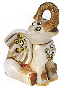
Beautiful "Luck Elephant" by Jay Strongwater, Estée Lauder, $295; 888-888-4757.