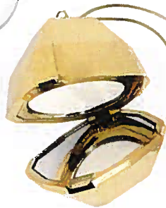
Lady Million compact, Paco Rabanne, $48; sephora.com.