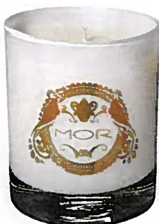
Soy wax in Belladonna, MOR, $32/6.5 oz.; morcosmetics.com.