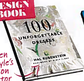
100 Unforgettable Dresses, by Hal Rubenstein, $35; harpercollins.com.