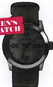
Stainless steel with canvas strap, Nixon, $120; nixonnow.com.