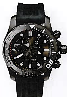
Stainless steel with rubber strap, Victorinox Swiss Army, $995; swissarmy.com.