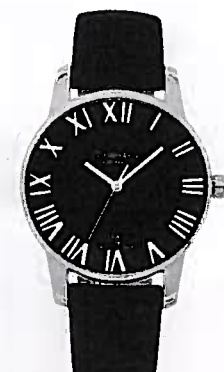
Stainless steel with leather strap, Tiffany & Co., $2,250; tiffany.com.