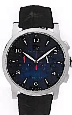
Stainless steel with alligator strap, David Yurman, $4,500; davidyurman.com.