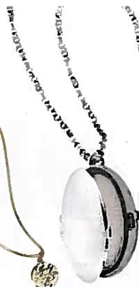
Shirley locket necklace, Chloé, $60; 212-753-4000.