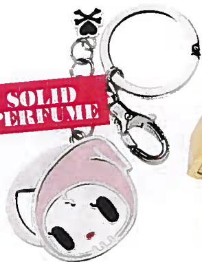
Ciao Ciao key chain, Tokidoki, $26; sephora.com.