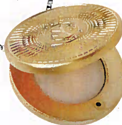
Nuits de Noho token, Bond No. 9 New York, $85; bondno9.com.