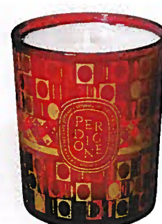
Vegetable and paraffin wax in Perdigone, Diptyque, $68/6.5 oz.; diptyqueparis.com.