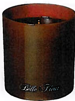
Soy-blend wax in Neroli Pine, Belle Fleur, $48/7.5 oz.; bellefleurny.com.