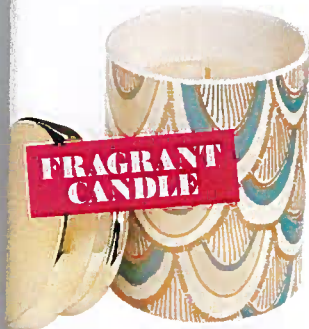
Soy wax and beeswax in Twilight Vanilla, Illume, $20/9 oz.; illumecandles.com.