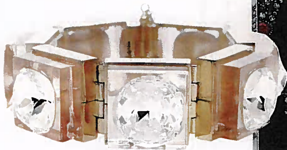
1. NINA RICCI