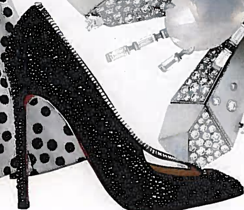
17. CHRISTIAN LOUBOUTIN