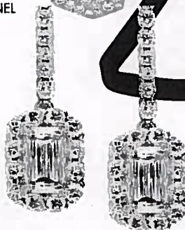
16. CHRISTOPHER DESIGNS