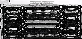
14. JUDITH LEIBER