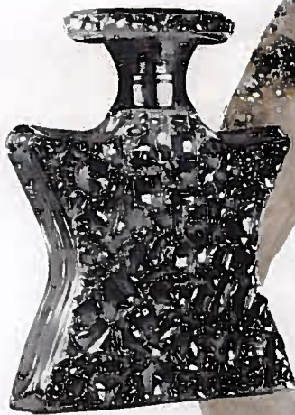
12. BOND NO. 9