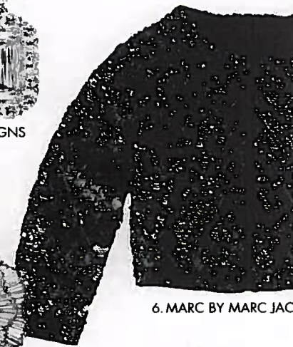
6. MARC BY MARC JAC