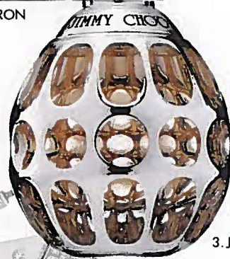
3. JIMMY CHOO