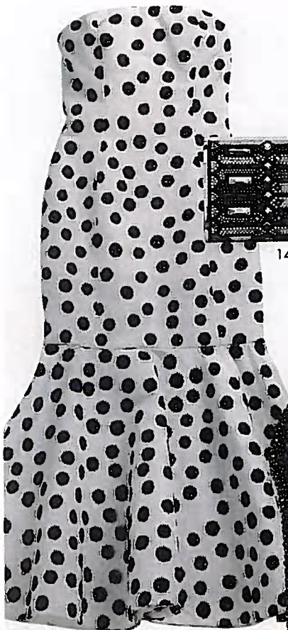
13. OSCAR DE LA RENTA