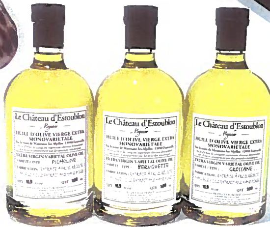
Le Château d'Estoublon olive-oil set. This artisanal trio elevates humble EVOO to the level of fine wine. $250; bergdorfgoodman.com.