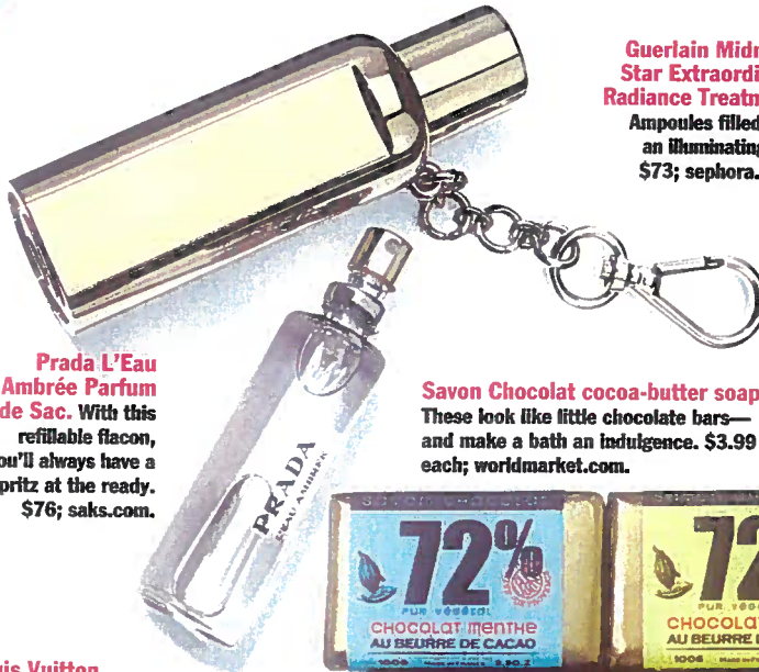
Prada L'Eau Ambrée Parfum de Sac. With this refillable flacon, you'll always have a spritz at the ready. $76; saks.com.