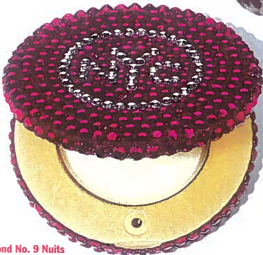
Bond No. 9 Nuits De Noho Perfume Token. A jasmine-vanilla solid fragrance in a Swarovski-crystal compact. $300; bondno9.com.