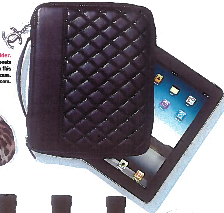
Chanel iPad holder. Fashion meets function with this sleek lambskin case. $1,555; chanel.com.