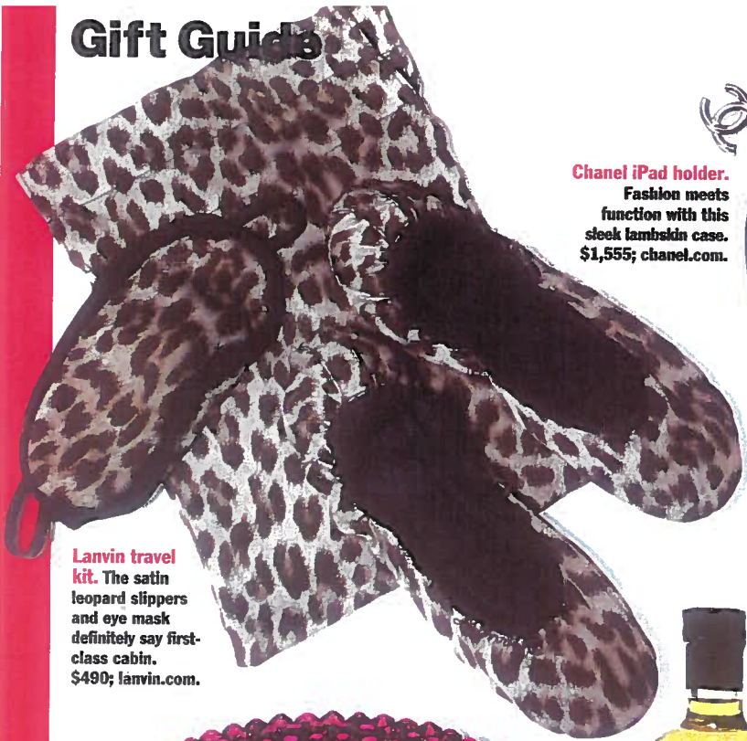
Lanvin travel kit. The satin leopard slippers and eye mask definitely say first-class cabin. $490; lanvin.com.