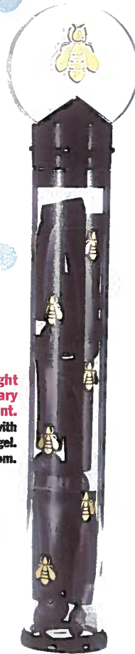
Guerlain Midnight Star Extraordinary Radiance Treatment. Ampoules filled with an illuminating gel. $73; sephora.com.