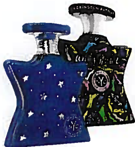
Nuits de Noho and Andy Warhol Lexington Avenue eaux de parfums, $160 each/50 ml; bondno9.com.

I never wear just one ... Fragrance. I like to create a unique scent by layering two. Right now it's Noho over Warhol, both from Bond No. 9.