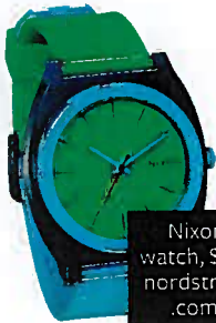
Nixon watch, $60; nordstrom.com.

I love diamonds, but ... Nixon watches are the best accessories. They are super-stylish, and I can wear them out skateboarding or to a club—they go with everything.