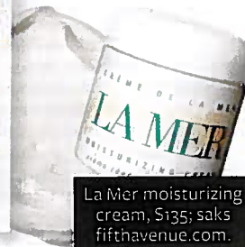
La Mer moisturizing cream, $135; saksfifthavenue.com.

I always travel with ... A tub of La Mer and a good cleanser to take off my makeup. Those are my two essentials.