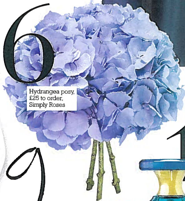
Hydrangea posy, £25 to order, Simply Roses