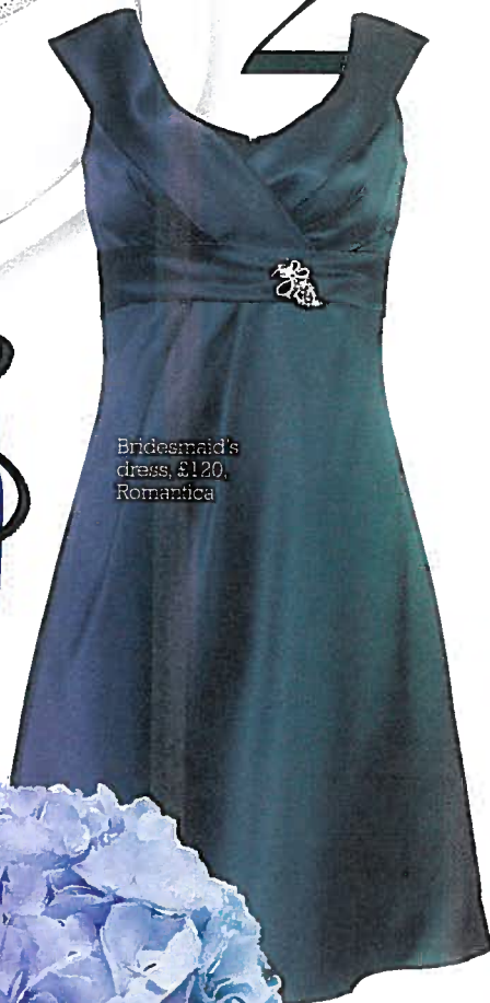
Bridesmaid's dress, £120, Romantica