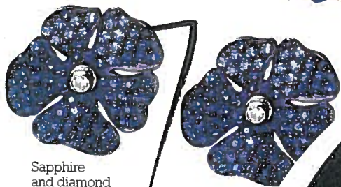
Sapphire and diamond earrings, £2495, Astley Clarke