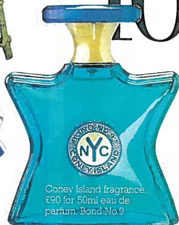
Coney Island fragrance, £90 for 50ml eau de parfum. Bond No.9