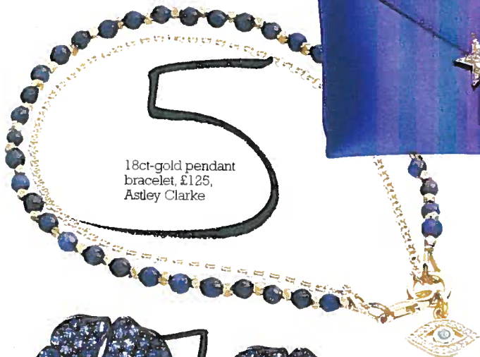
18ct-gold pendant bracelet, £125, Astley Clarke