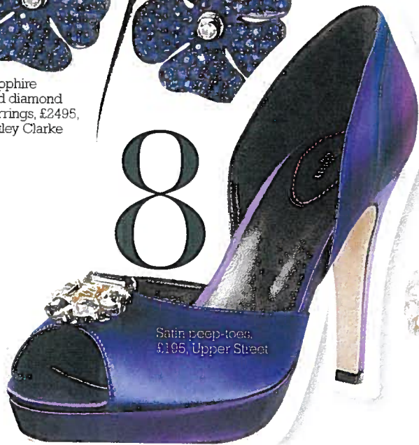
Satin peep-toes, £185, Upper Street