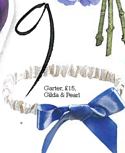
Garter, £15, Gilda & Pearl