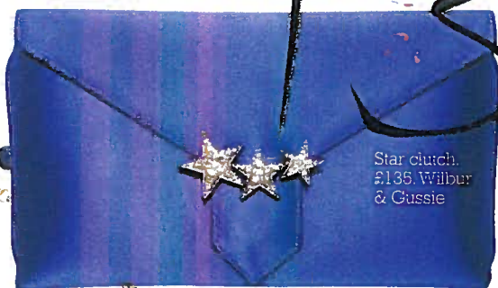
Star clutch, £135, Wilbur & Gussie